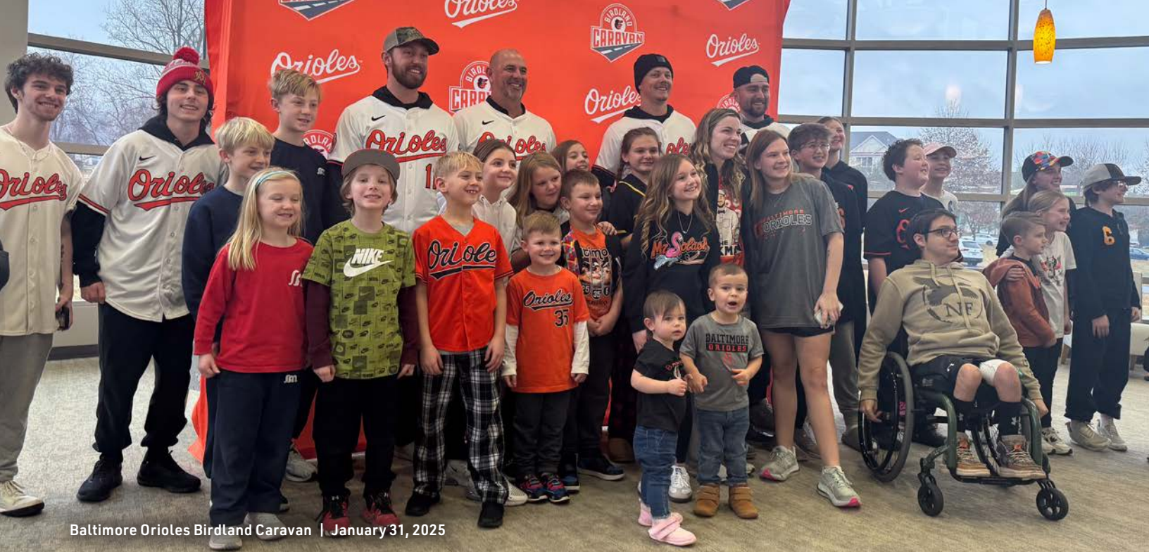
Baltimore Orioles Birdland Caravan | January 31, 2025