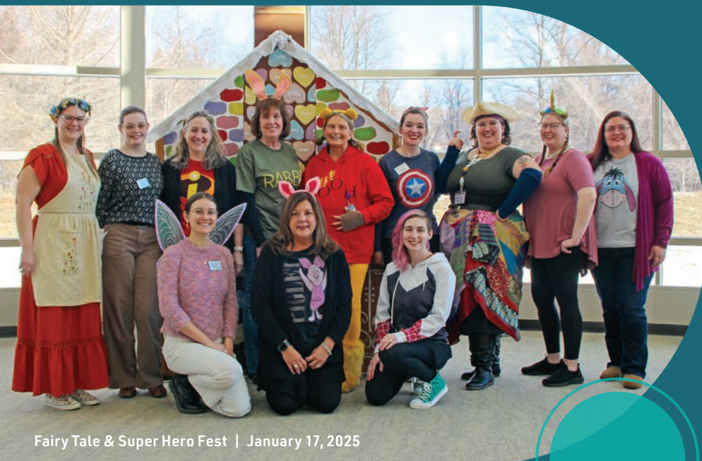
Fairy Tale & Super Hero Fest | January 17, 2025