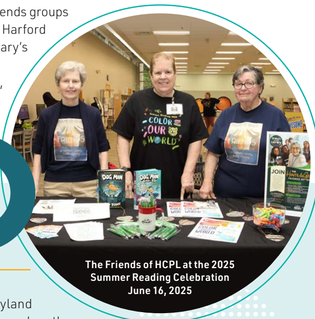
The Friends of HCPL at the 2025 Summer Reading Celebration June 16, 2025

Simply put, the Friends groups are at the heart of Harford County Public Library's story – one that continues to grow, thanks to their support.